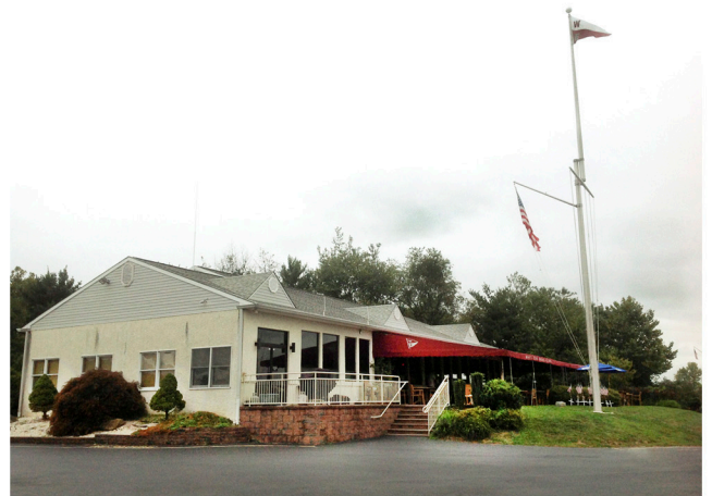
WEBC Clubhouse. Westward view, 2014.