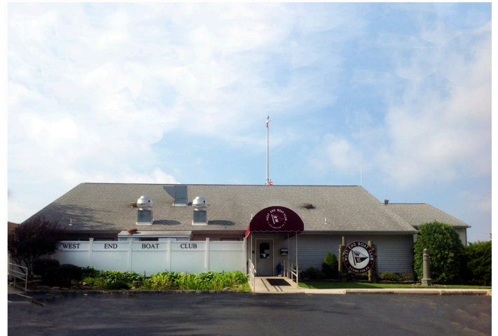
WEBC Clubhouse. Rear view, 2014.