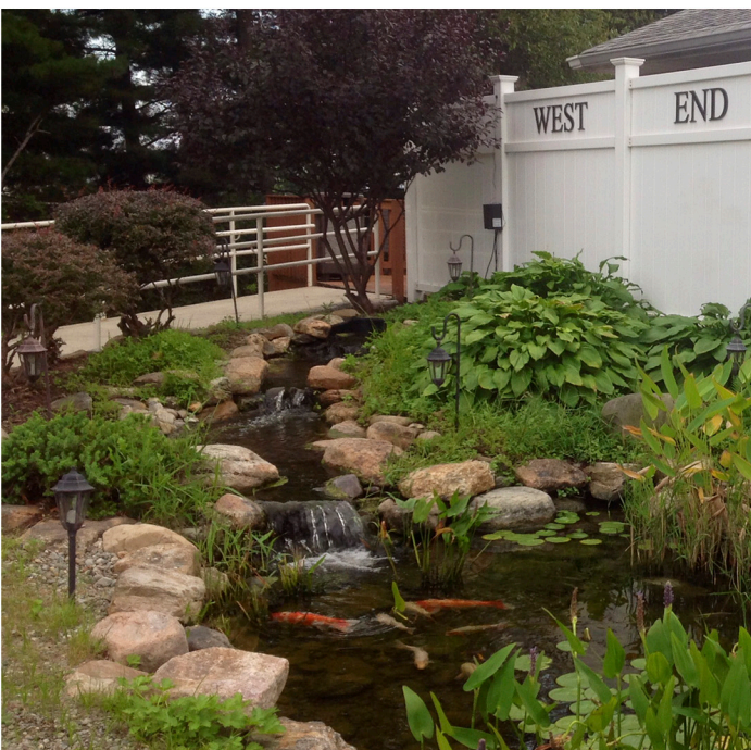
WEBC Koi pond, 2014.