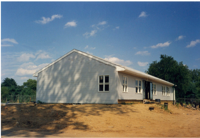
WEBC Clubhouse. Westward view, ca. 1992.