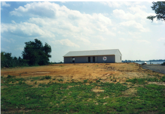
WEBC Clubhouse, during construction. Rear view, ca. 1992

Please enjoy a few early and recent photographs of the WEBC in Essington.